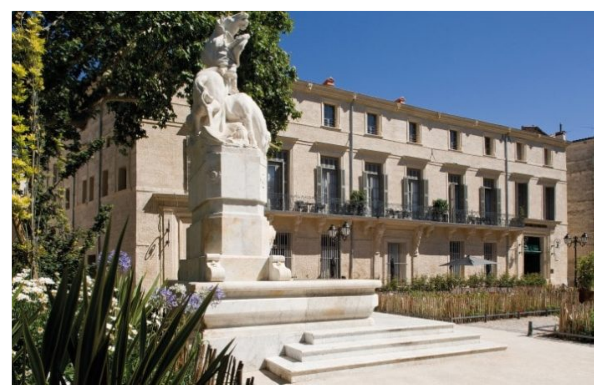
Pourcel Hôtel Richer de Belleval - façade @ agence sweep jerome mondiere

具 🛯 🅁 Print This Post 🛛 🖂 E-Mail article