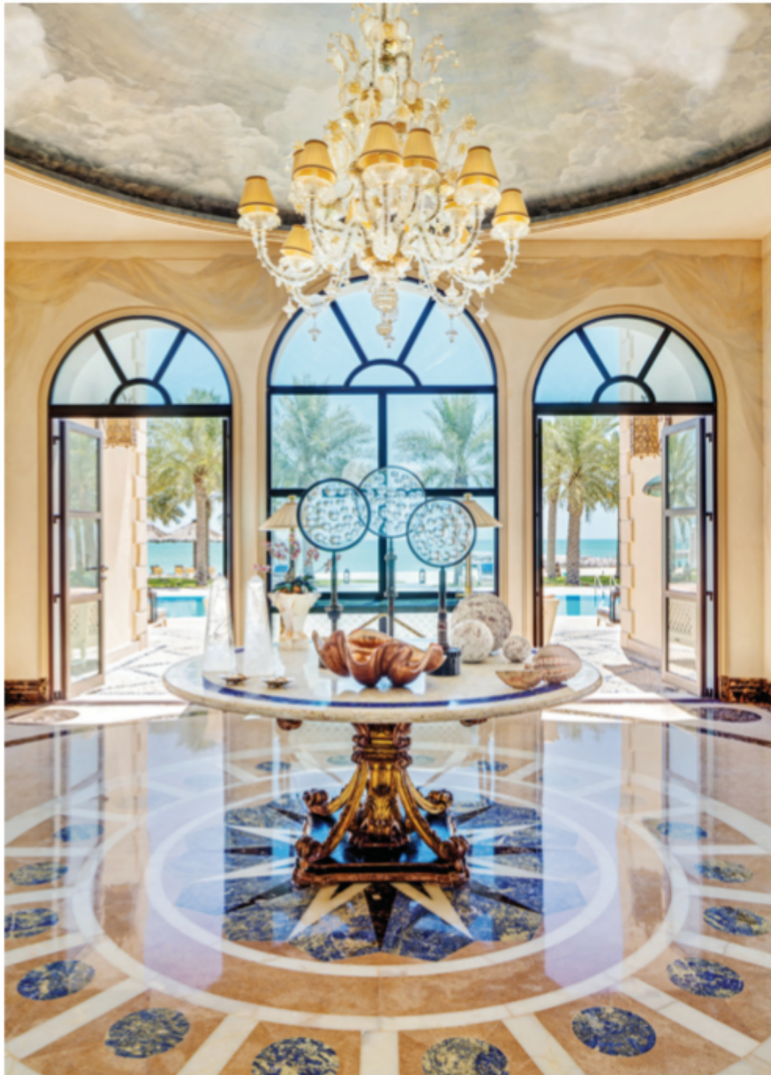
ABOVE: A hallway leading to the beach is furnished with an 18th-century table base from Bonhams, which has a custom-made mother-of-pearl and malachite top. The ceiling dome is decorated with a white-gold-leaf and crushed-pearl finish by Atelier de Ricou. OPPOSITE PAGE FROM TOP: The house's apricot stucco exterior recalls 19th-century Mediterranean villas; the pool pavilion, adorned in fresh nautical hues. The sofas are from McKinnon & Harris and the seat cushions and blue curtain fabric were sourced from Perennials Fabrics.