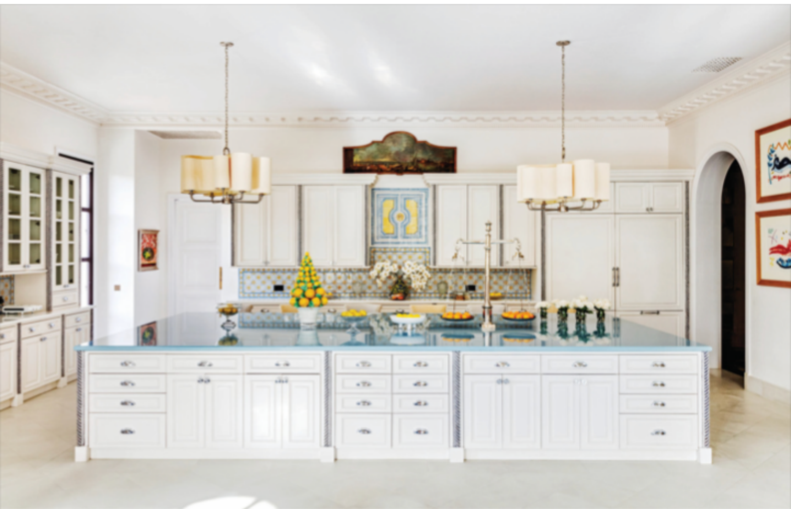
ABOVE: Corrigan designed the bespoke kitchen, which has a blue stone island worktop by Stone Italiana and the walls are adorned with decorative tiles from Country Floors.